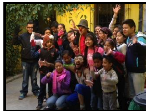
Our Students & Roadie the Clown