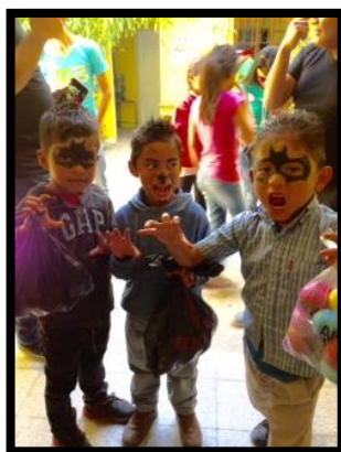
The Three Supermen